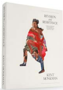
Image use is limited to articles related to Revision and Resistance: mistikôsiwak (Wooden Boat People) at The Metropolitan Museum of Art only. For all other uses, please contact the permission holders at their respective institutions, as listed in the image credits below.