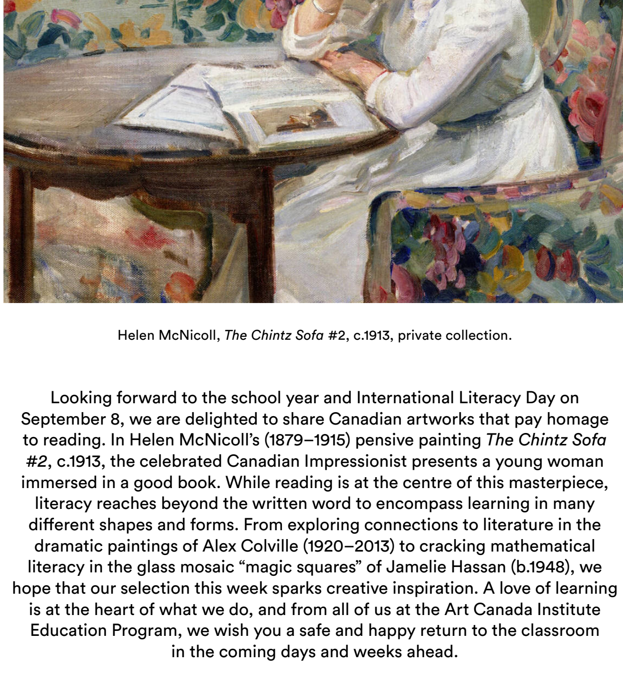
Helen McNicoll, The Chintz Sofa #2 , c.1913, private collection.

As back-to-school beckons and with International Literacy Day just around the corner, here are 5 Canadian artists to help us celebrate learning, literacy, and a love of books.