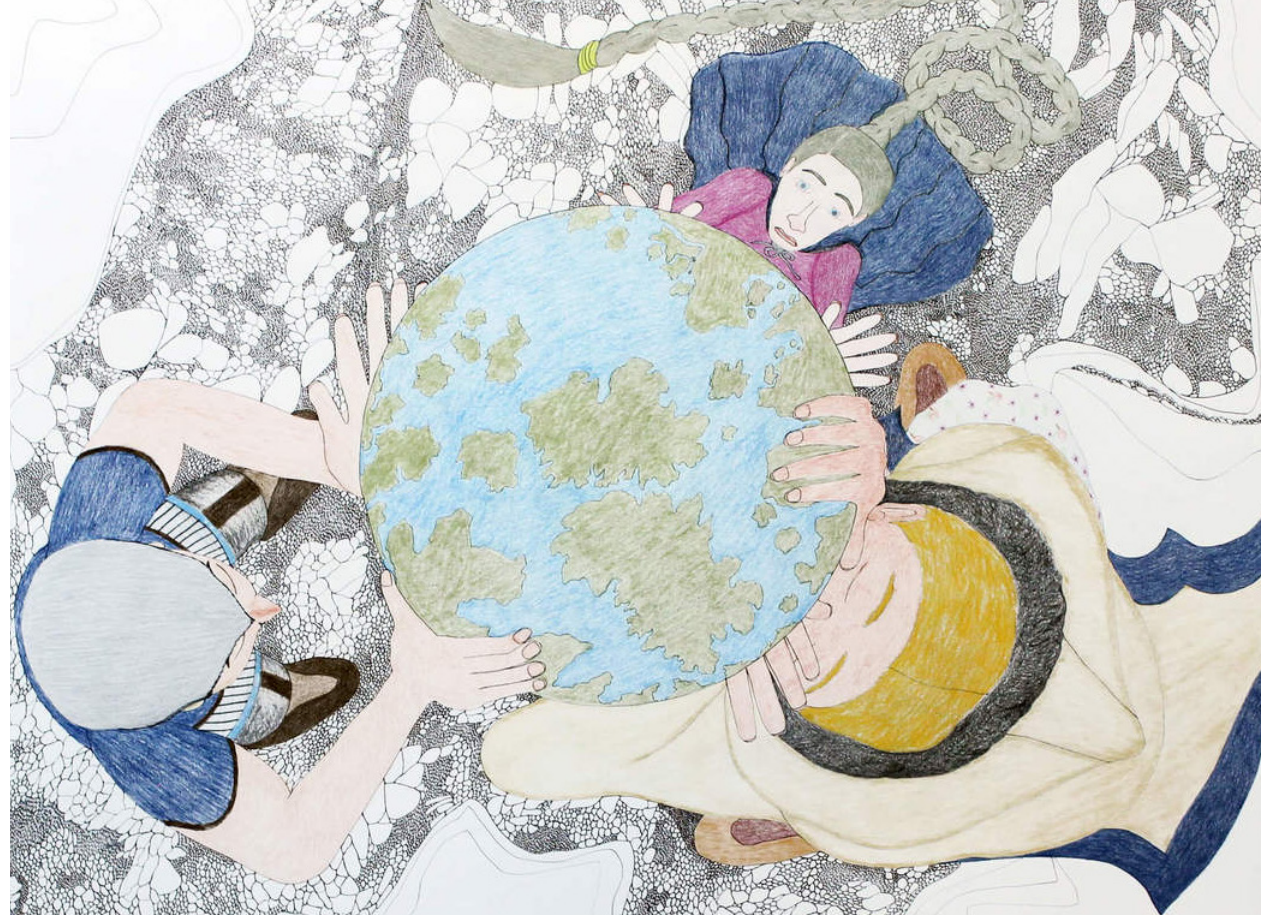
Shuinai Ashoona, Composition (Holding up the Globe) , 2014, ink and coloured pencil on paper, 95.3 x 120 cm, Collection of BMO Financial Group.

Very best wishes for the return to teaching in 2022