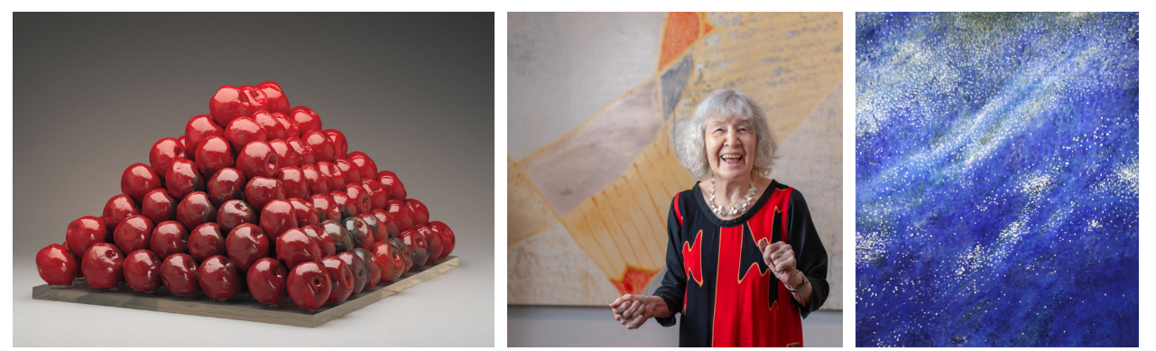
LEFT: 196 Apples, 1969–70. CENTRE: Photograph by Tom Gould. RIGHT: Pieces of Water #10-El Salvador, 1982

An artist of unprecedented reinvention, Gathie Falk has mesmerized the Canadian art world for more than six decades with works in painting, drawing, sculpture, ceramic, installation, and performance. With diverse materials but a distinctly personal vision, she transforms everyday items like fruit, shoes, and furniture into objects of wonder. From modest Mennonite beginnings, Falk rose to fame in Vancouver in the mid-1960s and has continued to garner international acclaim. A new book explores her fascinating life and groundbreaking contributions to contemporary art.